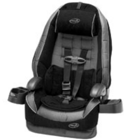
Evenflo Chase FF 20 to 40 lbs.