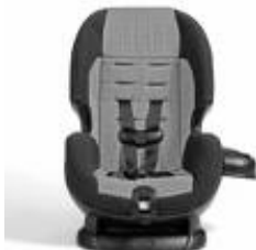
Cosco Scenera – FF 22 to 40 lbs.

* Note: Some newer seats will go to higher weight limits.