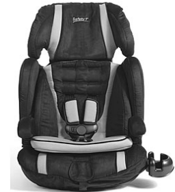
Safety 1 st Apex 65 FF 22 to 65 lbs.