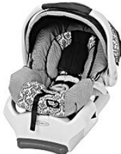
Graco Safe Seat RF 5 to 30 lbs.