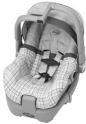
Evenflo Discovery 5 RF 5 to 22 lbs.