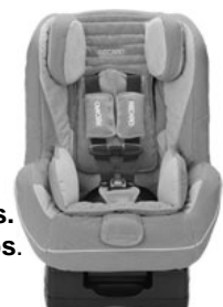
Recardo Signo G2– RF 5 to 35 lbs. FF 20 to 70 lbs.

* Note: Some newer seats will go to higher weight limits.