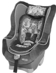
Graco My Ride 65 – RF 5 to 40 lbs. FF 20 to 65 lbs.