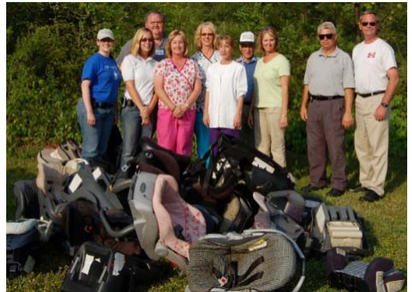
CPSTs from multiple agencies participated in Walker County's Child Passenger Safety Seat Week.