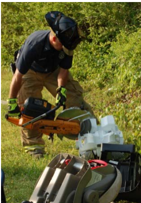
Walker County firefighters destroyed unusable car seats.