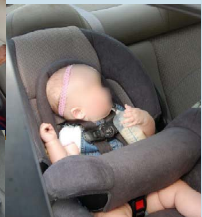
On left (top and bottom): infant seats forward-facing On right: 6-month old forward-facing (faces obscured for anonymity)