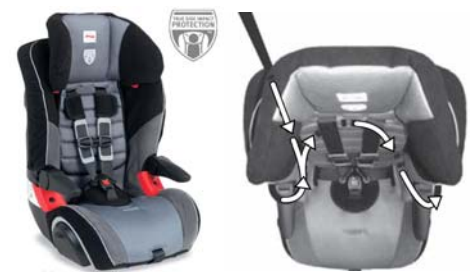
Britax Frontier (L) and optional long belt path (R)

This seat retails for approximately $280. Visit www.britaxusa.com for more information and “Tips for Challenging Installations.”