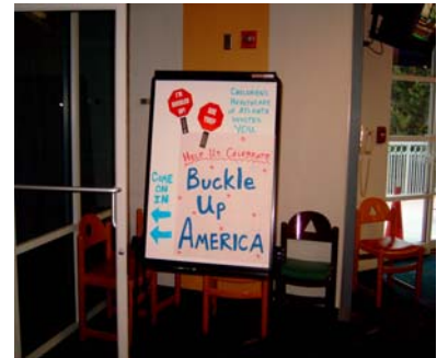
CHOA's sign encouraging parents and staff to Buckle-up.

A fun time was had by many and over 4,000 people received information on crash dynamics, child safety seats, booster seats, and safety belts.