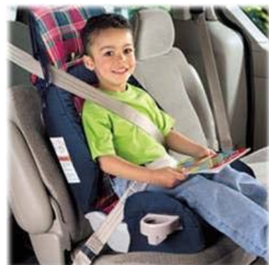
Belt Positioning Booster

must be secured in a booster seat went in effect on July 1, 2004. Many parents and caregivers are providing maximum protection for their children with proper use of child safety seats and booster seats. Unfortunately, there are others who remain unaware of the importance of proper use of child restraints and many children are riding in vehicles in an unsafe manner. Lets do everything we can to reach these parents with our lifesaving message.